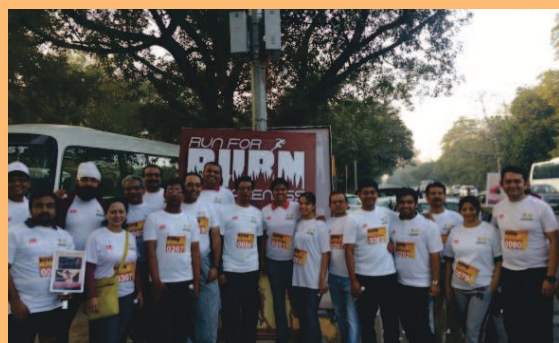
Marathon for Burn Awareness