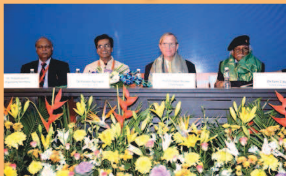
Inauguration of APSICON