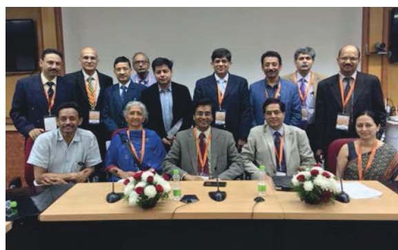
EC Meeting, New Delhi, 23 Nov. 2016