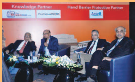
Panel on Ethics of Advertising