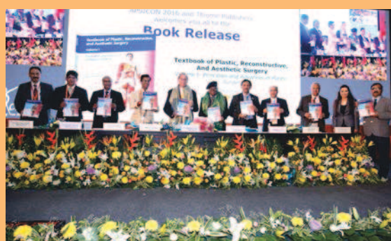
Release of the Text Book