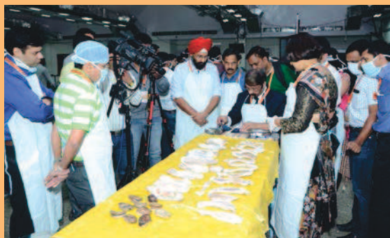
Ear Reconstruction Workshop

conference 'Scaling New Heights' is apt and wished that conference will achieve it.