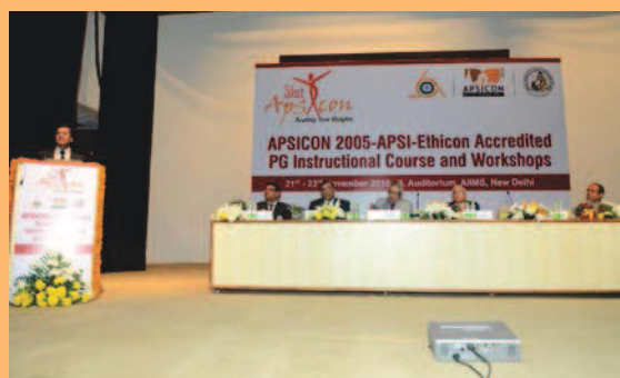
21st APSI Course Inauguration