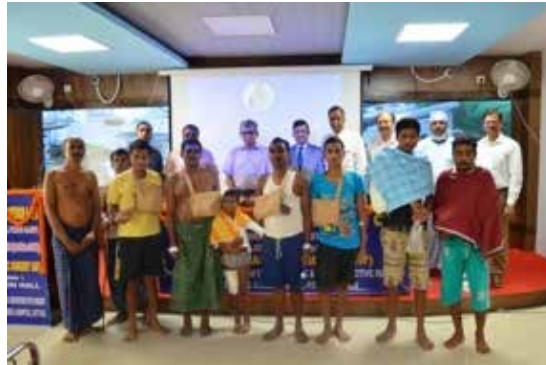
SCB Medical College, Cuttack, Odisha

On eve of the World Plastic Surgery Day, the Post-Doctoral Department of Plastic, Reconstructive Surgery, SCB Medical College, Cuttack, Odisha conducted a Live Operative Workshop on Brachial Plexus injury.