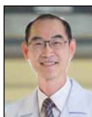
Sanguan Kunaporn Plastic and Sex Reassignment Surgeon, Phuket Plastic Surgery Institute Phuket International Hospital Phuket, Thailand