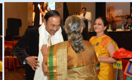
FELICITATION OF PAST PRESIDENTS