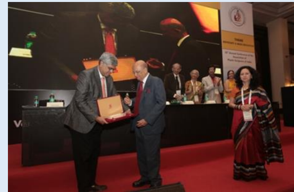
PLASTIC SURGEON OF THE YEAR AWARD