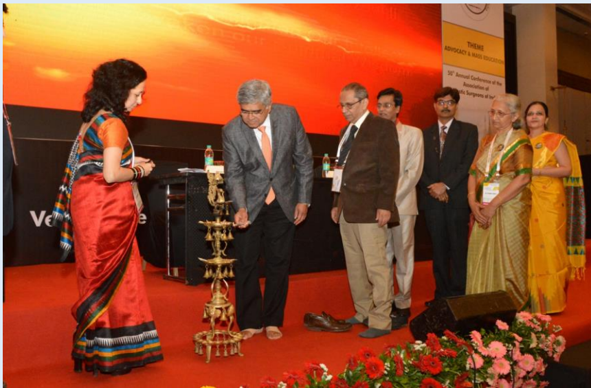
INAUGURATION: LAMP LIGHTING