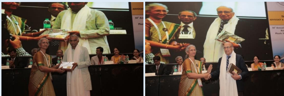
FELICITATION OF SPECIAL INVITEES