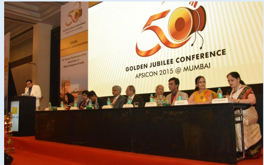
DIGNITARIES ON DIAS