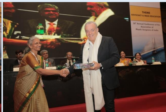
FELICITATION OF FOREIGN GUESTS