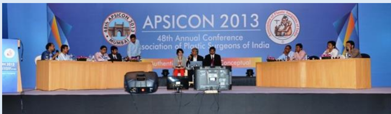
Glimpse of final rounds of Prof. S. K. Bhatnagar Quiz Competition