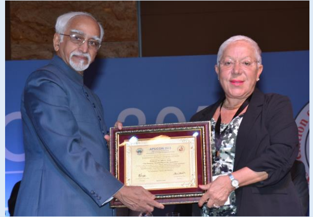
The History of Plastic Surgery was presented in a novel way, with representatives of IPRAS and APSI participating. The grandure of the venue and the arrangements added to the evening.