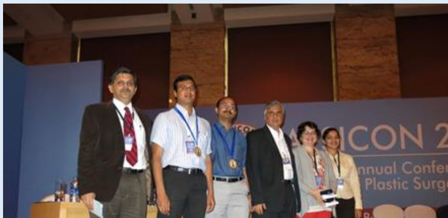
The winners of Prof. S. K. Bhatnagar Quiz with the Quiz Masters

Draft Minutes of General Body Meeting held on 26 th November 2013 in Mumbai shall be published in next newsletter no 67 of April 2014