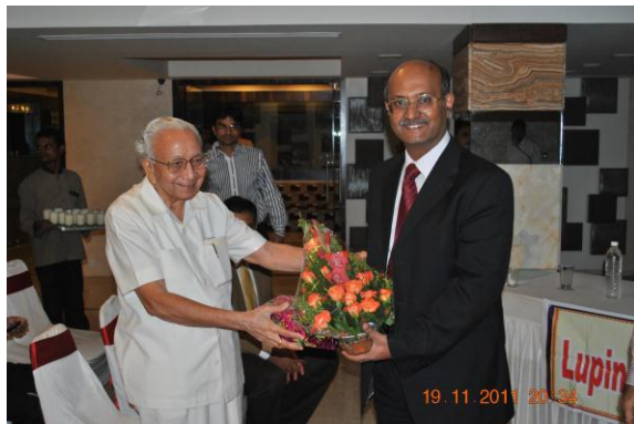
The President visited Ahmedabad ,delivered oration for Surgeons Conference