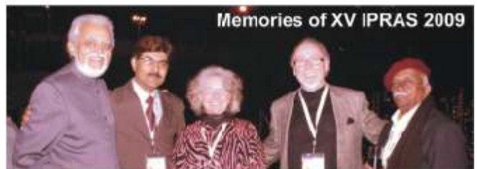
Memories of XV IPRAS 2009