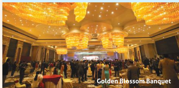
Golden Blossom Banquet

Theme: “ Innovate to Excel, Research to Lead, Propagate to Prosper”