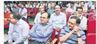
सेमिनार में मौजूद रिस के विकल्सक.