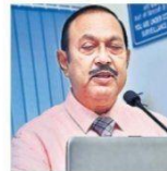
सेमिनार को संबोधित करते डॉक्टर.